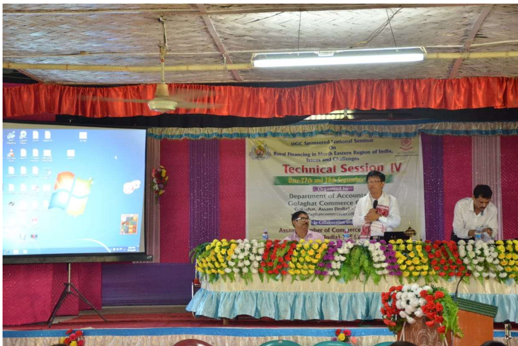
Snapshots of the Seminar