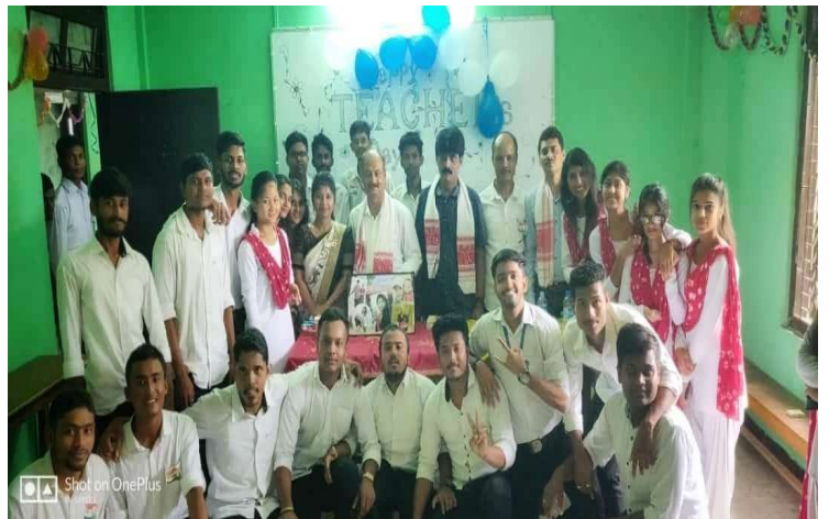
Teachers Day Celebration

The students and teachers of the Department actively participate and celebrate various occasions and events including Teachers day celebration, Farewell ceremony, etc from time to time. This kind of celebrations aids the department to create a cohesive environment and close bond within the departmental teachers and students.