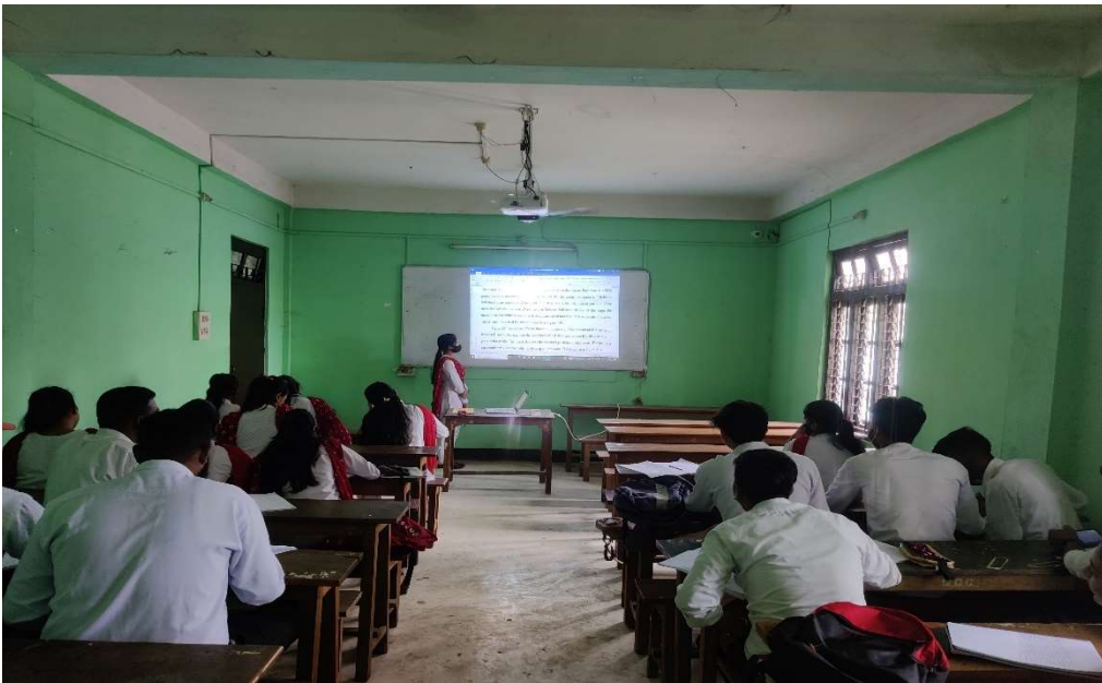
Snapshots of the classes