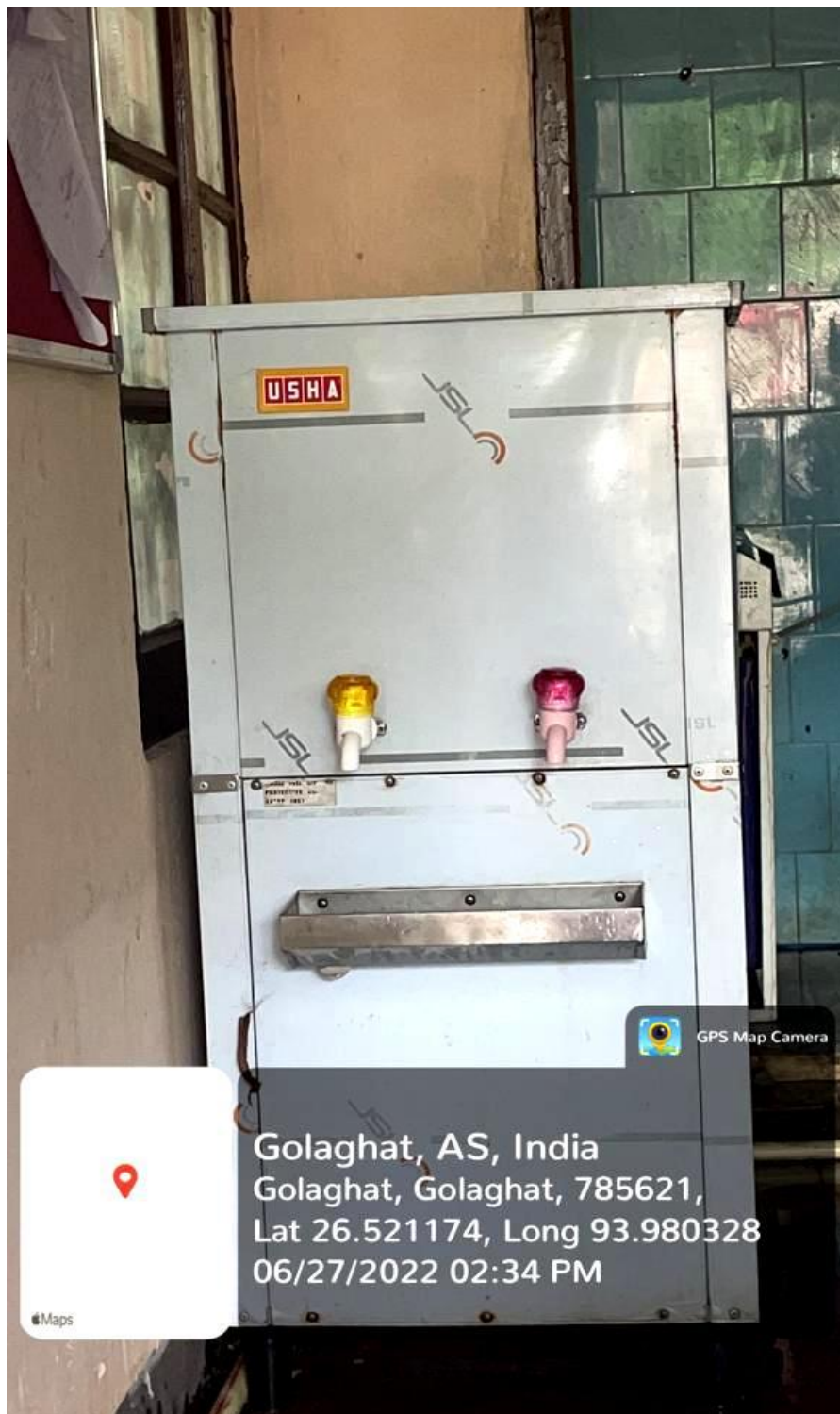
Photo: Refrigerated Drinking Water