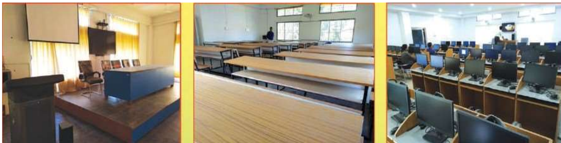
Video Conferencing Hall