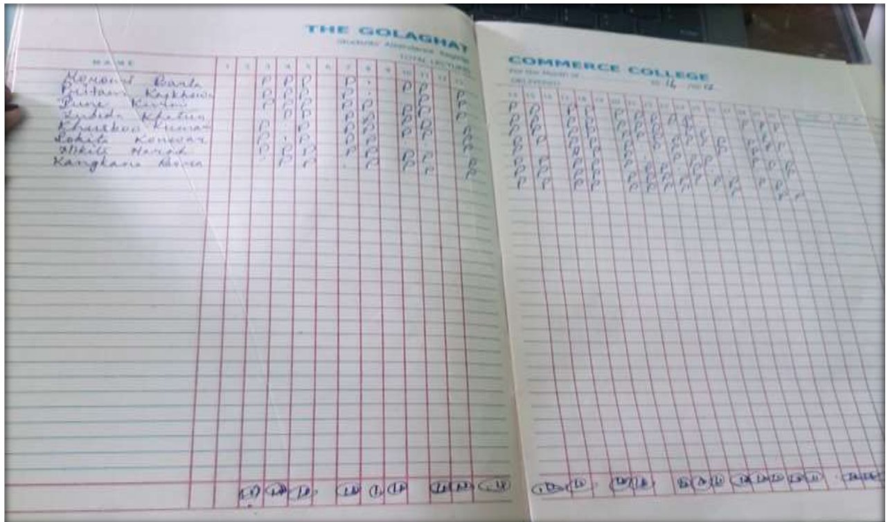
Picture: Attendance of Students