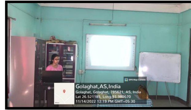
Seminar Presentation by M. Com students on Statistics on 14.11.2022