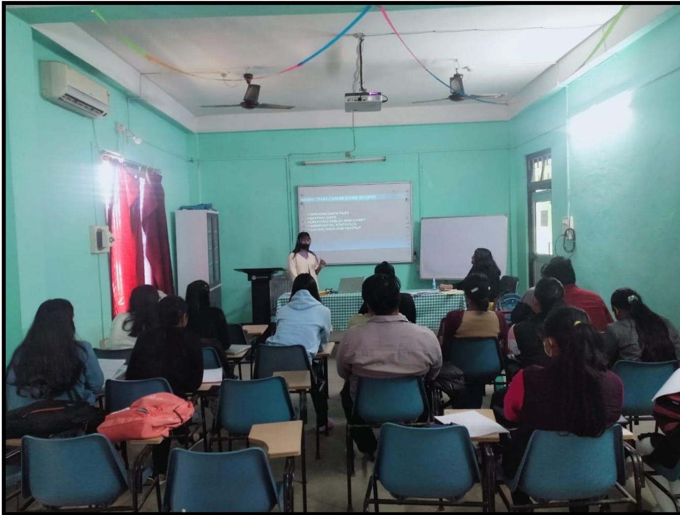
Seminar Presentation by M. Com students on Statistics on 18.12.2021