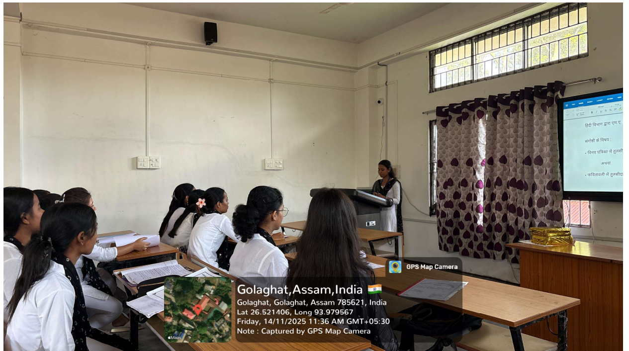
Seminar Presentation by PG 1 st Semester Students – 2025.