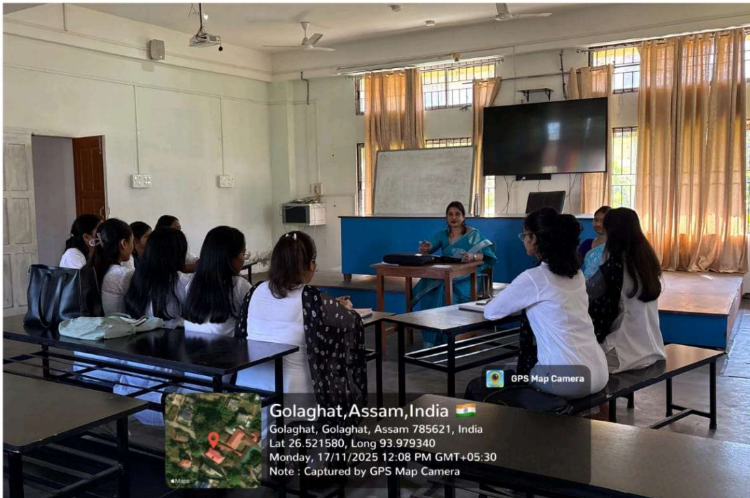
Group Discussion by PG 1 st Semester Students – 2025