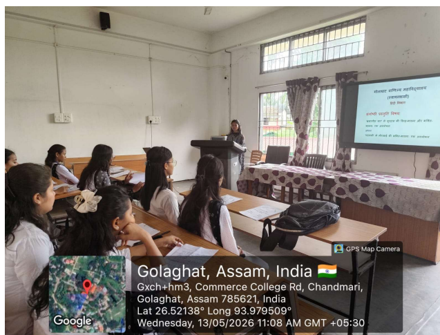
Seminar Presentation by Students of PG 2 nd Semester - 2026